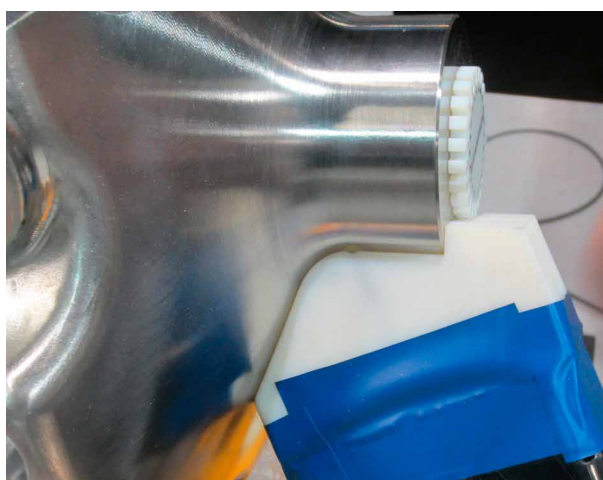
Hermetic in-house designed chamber to be specifically adapted to the treatment area