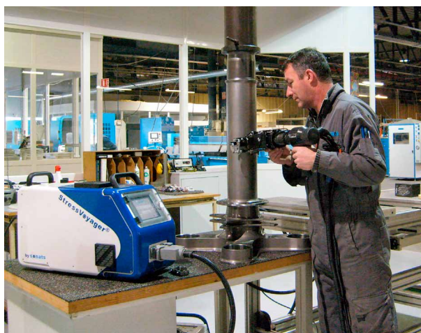
Portable equipment for in and ex-situ services (here: helicopter rotor vertical shaft)